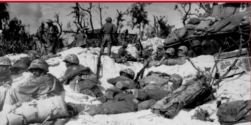
Peleliu Island...Marines move through the trenches on the beach during the battle.