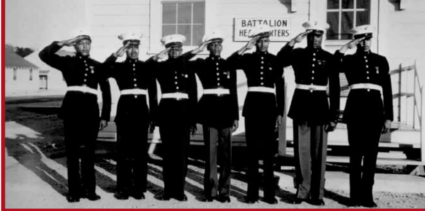
A dress uniform wasn't a part of the standard uniform issue in 1943, yet most of the Montford Point Marines spent $54 out of their pay for what was generally considered the sharpest uniform by most of them.

The first Montford Point Marines were trained to form the 51st Composite Defense Battalion, which was activated on August 18, 1942. It was the first black combat